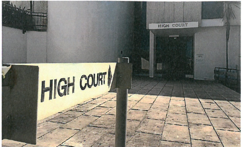
Court should be the last port of call in resolving a dispute.

If there are multiple issues, parties may agree to dispose of